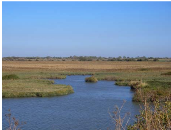
Figure 1. An idea of what much of the Delta looked like at one time comes from the recently reflooded Liberty Island, which has rapidly become a wetland with shallow tidal sloughs winding through patches of tules and other emergent plants. Photo by P. Moyle, September, 2008.

Such abundance implies high productivity, which was likely generated by nutrients from the extensive riparian corridors, marshes and seasonal floodplains. High connectivity among the habitats allowed the dispersion of these nutrients throughout the system and into the estuarine food webs, supporting the dense fish populations. These elements formed the key conditions for the historical estuary to function as a center of biotic abundance and diversity in central California. The arrival of Euro-Americans in Central California changed all that. In this essay, we discuss the series of major ecological changes that led to the present Delta and to the likely next ecosystem shift. We then provide some principles upon which to manage flows to try to direct change, rather than to just react to it.