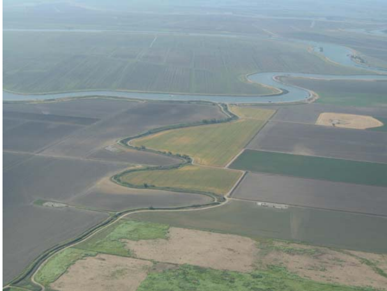
Figure 2. View of Delta today, where tidal wetlands been replaced by farmland and the rivers have confined channels. Note the sharp separation of aquatic and terrestrial habitats.

Francisco Estuary is one of the most highly modified and controlled estuaries in the world. The estuarine ecosystem has lost much of its former variability and complexity as indicated by major declines of many of its native fishes. Contributing to declines have been continual invasions of alien species and large changes in water quality from pollution and upstream diversions of fresh water.